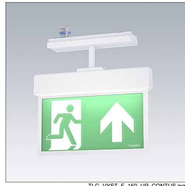
TLG VYST F 150 UP CONTUS.jpg